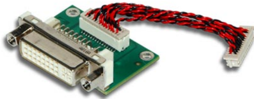
Optional KAB-PEG-DVI1 Adapter