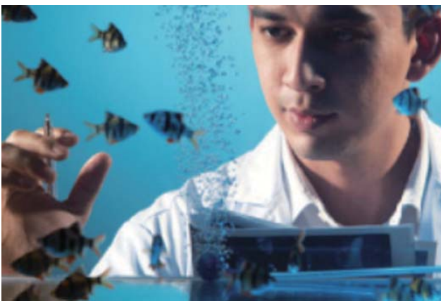
// WATER QUALITY MONITORING USES FISH BEHAVIORS AS BIO-INDICATORS

BIO-MONITORING IS A RELIABLE METHOD USED TO ASSESS WATER QUALITY, WHICH FUSES THE TECHNIQUES OF ENVIRONMENTAL PHYSICO-CHEMICAL CHARACTERISTICS AND BIOLOGICAL BEHAVIOR OBSERVATION. VIDEO ANALYSIS TECHNOLOGY IS THE IMPORTANT ENABLER TO IDENTIFY THE BEHAVIORAL PATTERNS OF BIO-INDICATORS.